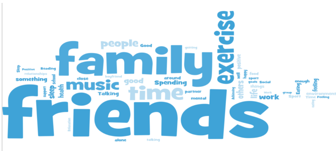
Figure 2. What makes you happy? (Wordle.net*) 1

More than half (61% of n = 569) of all participants stated they consciously spend time on improving or supporting their own mental health.